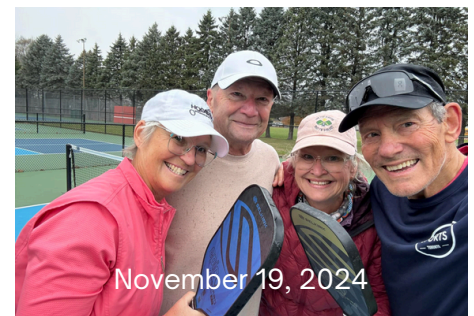
Last day of the 2024 Season