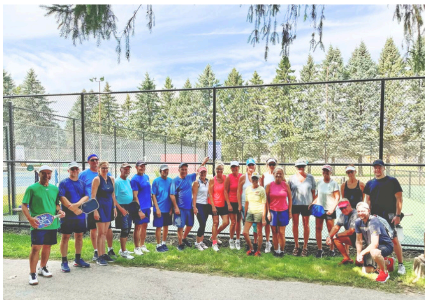
Participants at one of the summer tournaments