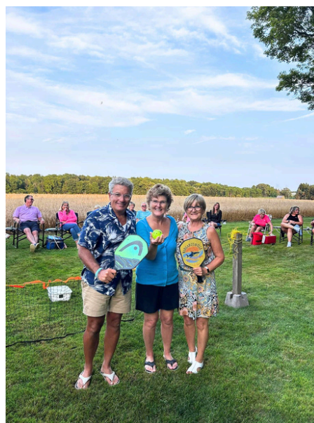
Club social events