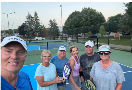
Free lessons for members

It's not talked about much but pickleball or the availability of pickleball in a community has become a deciding factor for people wanting to move somewhere new and out of the city. Tillsonburg has already proven itself to be ideal for anyone wanting to move somewhere new and exciting, safe, clean, filled with activity and possibility. More pickleball courts will certainly make Tillsonburg even more viable as the perfect place to live in Canada!